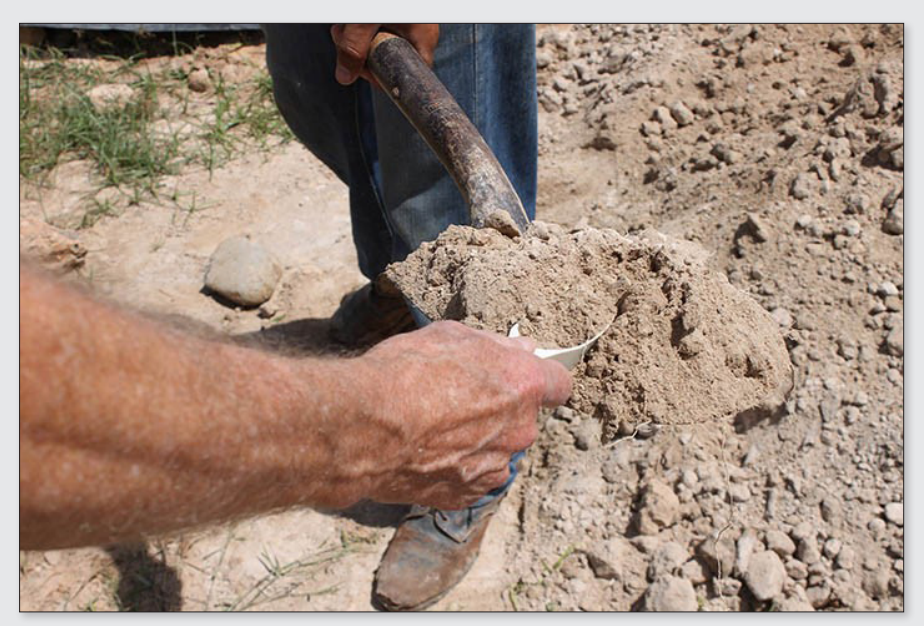
Figure 4. Incremental sampling from each shovel used to transport all original lots, see Figure 3.

After processing all primary tailings in the manner illustrated, quantitative analysis was carried out on a selected set of seven primary samples (project financing was at the time of the analysis also at a decidedly "barefoot" level). These samples were not easy to process, however, as they were all slurries and with very different Au and Hg contents. Slurry sampling is not easy under any circumstance, but especially not when