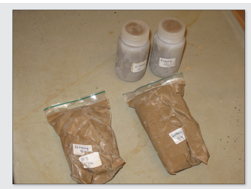
Figure 6. Two types of slurry sample containers as received from Nicaragua, plastic bottles and bags. The photo shows the frozen versions after 24 h in a freezer at -16°C, ready for sub-sampling, see Figures 7–8.

A novel twist had to devised: after vigorous and extensive mixing, the entire 1–2 kg slurry samples, which came in tightly sealed but otherwise conventional plastic bottles or bags, were stored in a freezer (–16°C) for 24 h, sufficient for the entire content to freeze solid. The "splitting" was then effectuated as a two- or three-step longitudinal sectioning of the solid bottle or bag content, see Figures 7 and 8. In this way any residual segregation affecting the vertical container