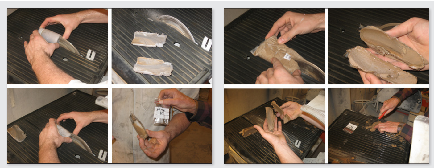
Figure 7. Two-stage mass reduction of frozen sample bottles. First cutting is a 50/50 split, followed by a further slice of one of the randomly selected half cores produced, resulting in a 10–15% final sub-sample mass, which is guaranteed to be representative of the original container content in the vertical dimension irrespective of the degree of possible residual segregation present.