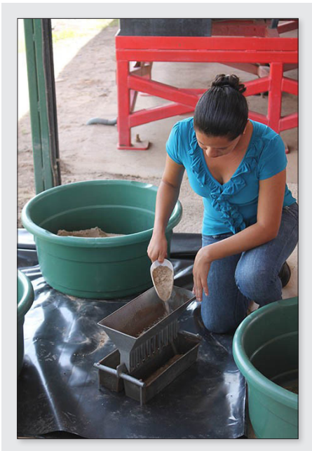
Figure 5. Loading the project riffle splitter (kindly provided by GEUS). Sub-sampling is made effective by the fact that the sample to be split does not need to be split all in one, but can be subjected to riffle-splitting in an intermittent loading process.<sup>7</sup>

stringent counter-volatility demands are to be upheld. Also, sub-sampling, although here carried out in a well-equipped laboratory (GEUS, Copenhagen), had to be performed with procedures that potentially can be carried out under the relevant ambient field conditions in Nicaragua.